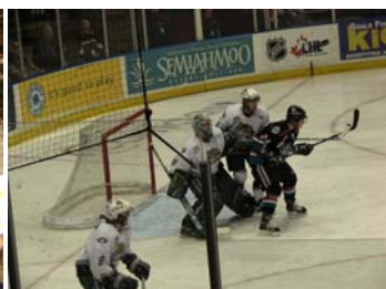
Silvertips guarding the net