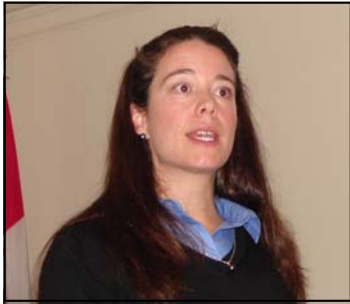
Mayor Liz Loomis spoke about changes in the City of Snohomish