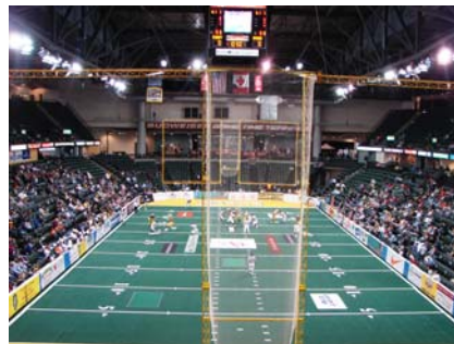
Arena football field...small