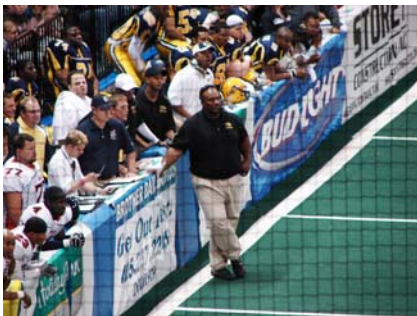
The now former coach