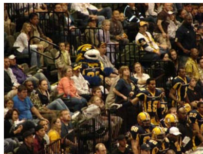
Hawk mascot with fans