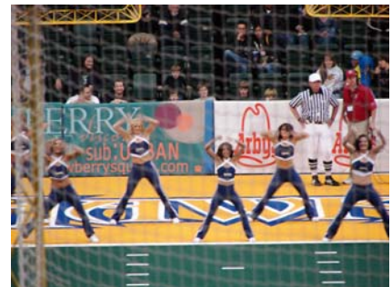
Well there was some entertainment