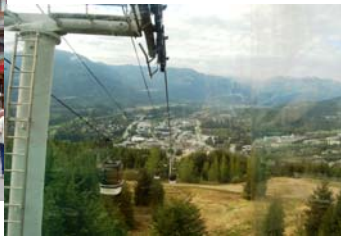
Looking down at Whistler