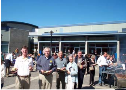
Socializing at lunch