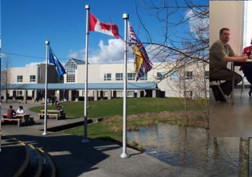
Sharing Ideas & Experiences

The annual District Assembly will be taking place from 8:00 a.m. to 2:00 p.m. The location is only a few miles up from the Canadian border at 1266672nd Avenue, Surrey, British Columbia. You can find more information and a location map, as well as register on-line, at our district's web site: www.district5050.org . Cost: $30.00 US.