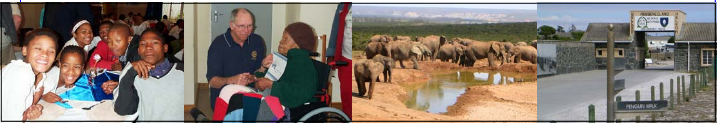
Students at St. Mary's School