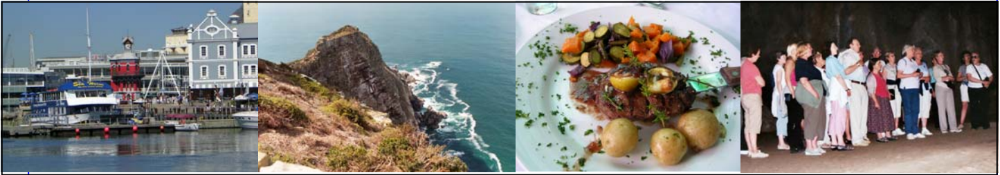
Cape Town Harbor

We want to share a brief sketch of what we experienced on our wonderful trip to South Africa. We are including excerpts from notes provided by one of our 25 travel companions, PDG Jack Frisk: "Flying from Vancouver, British Columbia, we arrived in Cape Town just as the sun was rising on a beautiful South African morning. Shortly after checking into our hotel we caught a taxi and went to get a view from the top of Table Mountain. It is a must see for the view and the history, including looking out toward Robben Island. The waterfront section must be the envy of other cities in the world because it is so clean and full of people in the stores and on the streets. We ate a lot of wonderful food on the trip, including calamari, fish, and ostrich; along with some great South African wine.