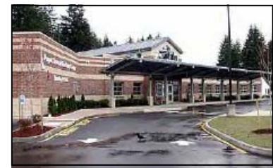
Puget Sound Kidney Center at Smokey Point

The Puget Sound Kidney Center currently has four not-for-profit free standing outpatient dialysis facilities. They have increased from 4 dialysis stations in 1981 to their current 86 stations, serving 426 patients who come in three times a week.